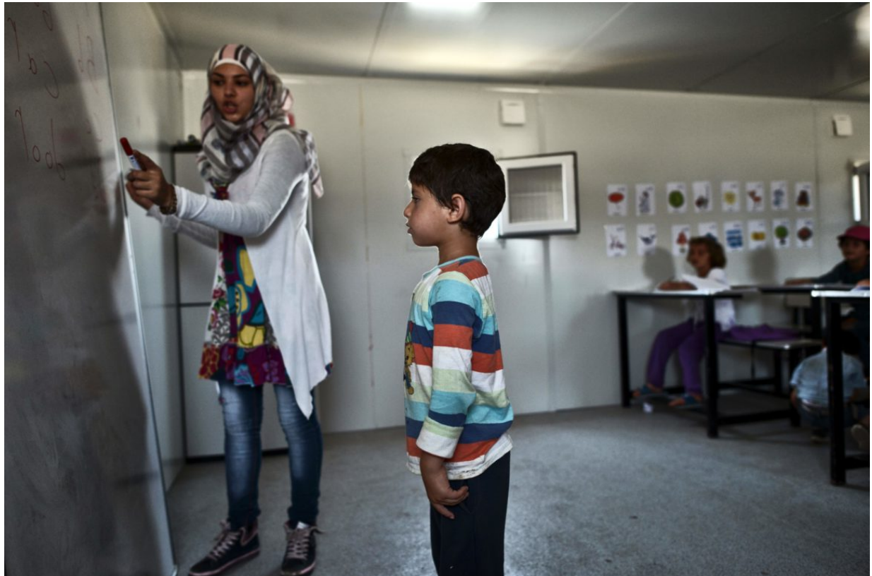
A refugee boy follows English lessons in a container which has been converted into a classroom at the Skaramangs camp